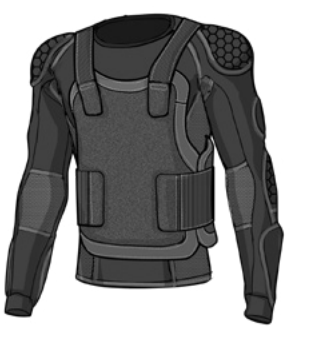
Designed to be combined with any ballistic vest

The PG4 – SHIRT is specifically designed to wear as an undergarment. An ideal replacement of traditional bulky & rigid protection. The Longsleeve Shirt has only protection on the arms as it is designed to be compatible with a ballistic vest.