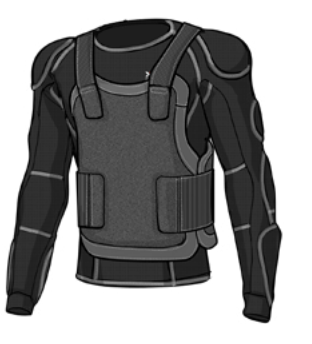
Designed to be combined with any ballistic vest

The DDS FR SHIRT is specifically designed for situations in which fire is a possible threat to the wearer. The main fabric has 4-way stretch & flame protective (ISO 15025) properties. The Shirt has protection on the shoulders & arms and designed to be compatible with a ballistic vest.