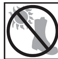
FIG. 7 Radiant heat from hot surfaces and flames can cause burns.

NEVER STORE YOUR FOOTWEAR IN DIRECT SUNLIGHT, INDIRECT SUNLIGHT, OR IN FLUORESCENT LIGHT (FIG. 7). Damage caused by exposure to light cannot be repaired, nor will the manufacturer cover such damage in its warranty. (See Warranty Information, Section 16 of this guide.)