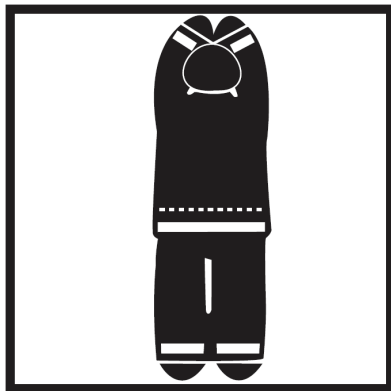
FIG. 4 NFPA Position A

For the first use of the zipper footwear, adjust the fit by loosening the laces, pulling on footwear, closing zipper, then tightening the laces for a secure and comfortable fit. Tuck ends of laces between the lace system and tongue area.