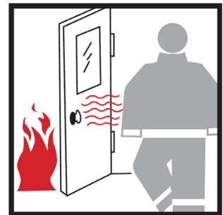
FIG. 6 Radiant heat from hot surfaces and flames can cause burns.

Thermal Radiation: Thermal Radiation is the transfer of heat in the form of light energy into a material, directly from flames or reflected from hot objects. Factors that affect the speed of radiant heat transfer include the temperature difference between two surfaces, their distance from each other, and the reflectivity of each surface.