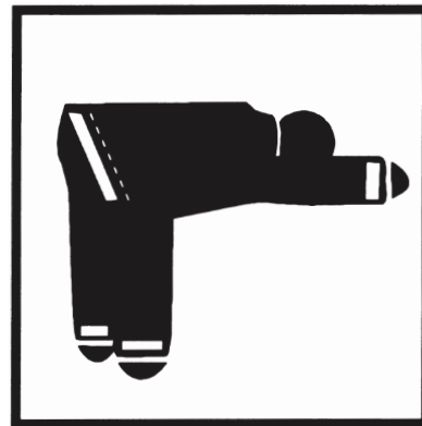
FIG. 5 NFPA Position B