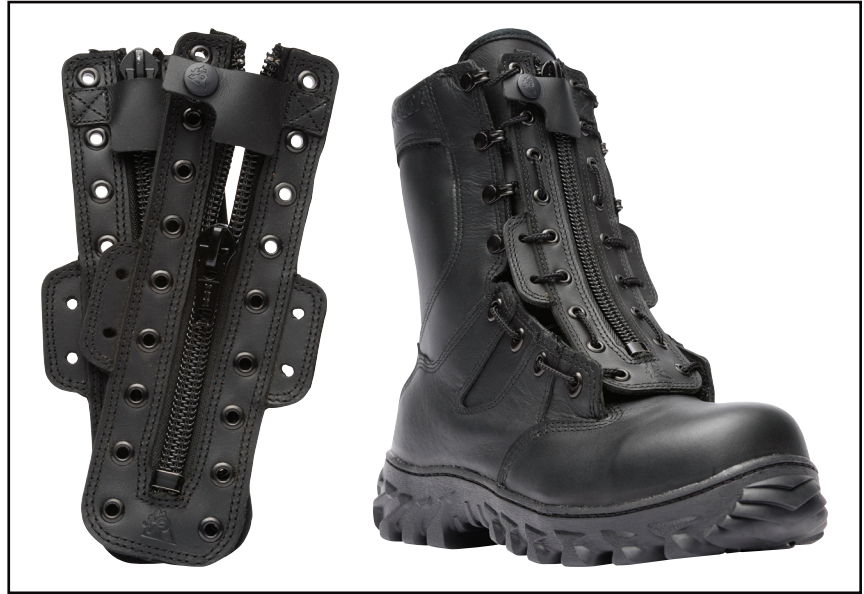
FIG. 9 RKD0098 Lace-In Zipper and Assembly shown with compatible Code Red: Rescue footwear.